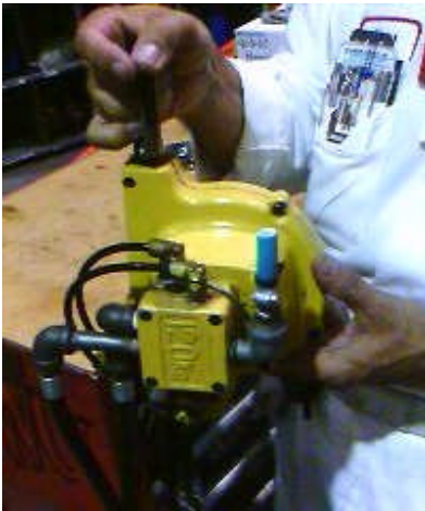
Out With the Old!

There are several factors in selecting the appropriate hoist for an application. Once you have found out the capacity, the amount of lift, variable speed pendant options, and chain container options: the only thing left to do is find out price and quality. The old hoist, Brand X, cost the plant several man hours of labor while trying to fix over the three years in use and needed to be replaced. The JDN Mini 125/3 hoist costs