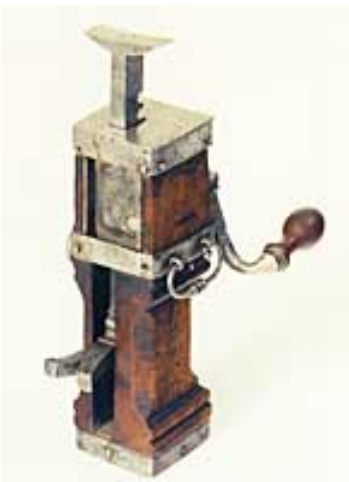
Wooden Shaft Winch